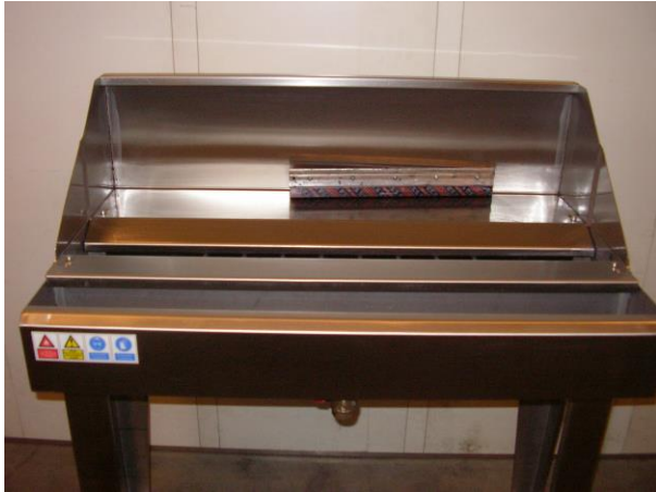
Squeegee washer 100 manual