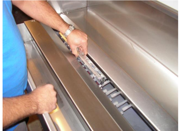
Dip the squeegee in the cleaner