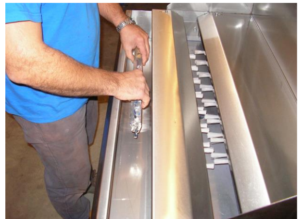
Dip the squeegee in the water tank in the front to rinse the squeegee and neutralize the cleaning liquid