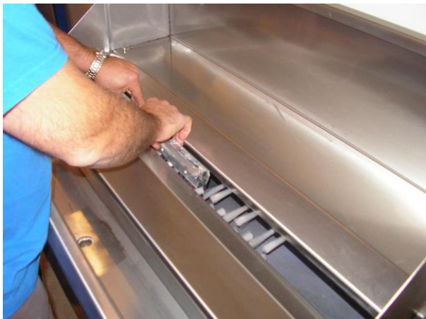
Move the squeegee from left to right along the brushes