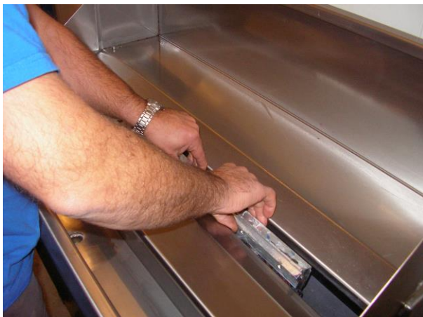
Remove the squeegee from the cleaning liquid and check that all ink is removed